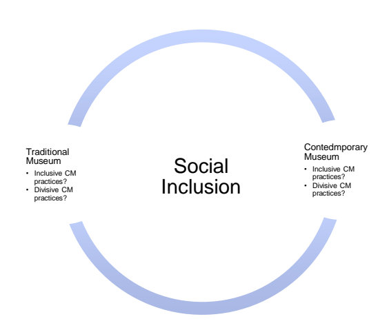
Figure 3: Exploration of Museum Practices

narratives. Semi-structured interviews of museum personnel, at various positions, and museums visitors, will aim to uncover the extent to which museum practice is guided by social cohesion and the means to which it is achieved through explicit or implicit processes. Figure 3 , emphasises the distinction between traditional and contemporary functions of museums and how they differ in fostering or preventing social cohesion.