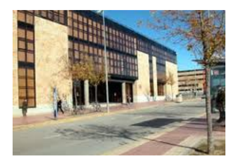
Facultad de Economía y Empresa – Main Entrance