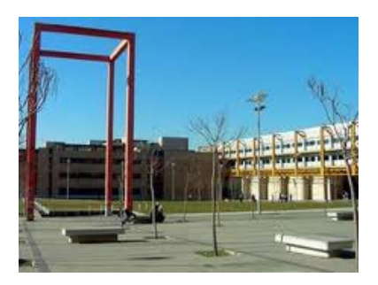
Universidad de Salamanca – New Campus

The Facultad de Economía y Empresa is located in the new campus of Universidad de Salamanca, just some minutes away from the bus station. The main entrance to the Course Venue is from 'Paseo de Francisco Tomás y Valiente'.