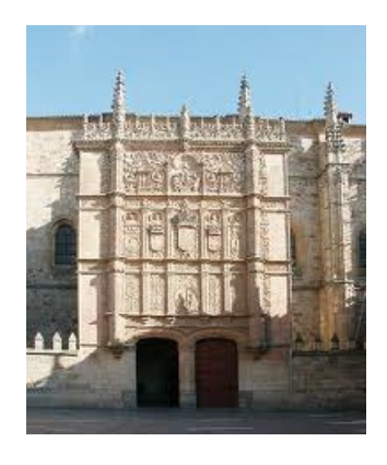
Old Facade – Universidad de Salamanca

Salamanca is a city in western Spain, in the region of Castilla and León. Because of its beautiful buildings and urban environment, the Old City was declared a UNESCO World Heritage Site in 1988. It is the most important University City in Spain and is known for its contributions to the teaching of the Spanish language. Salamanca attracts thousands of international students, generating a diverse multicultural environment.