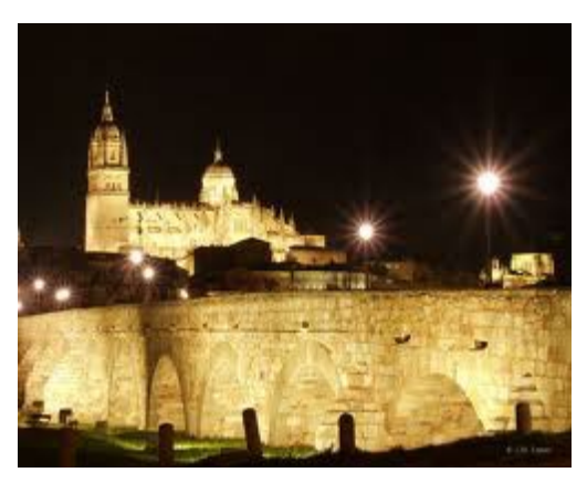
View of Salamanca - Cathedral and Roman Bridge

It is situated approximately 200 km (124 mi) west of Madrid and 80 km (50 mi) east of the Portuguese border. The University of Salamanca, which was founded in 1218, is the oldest university in Spain and the third oldest western university. With its 30,000 students, the university is, together with tourism, the economic engine of the city.