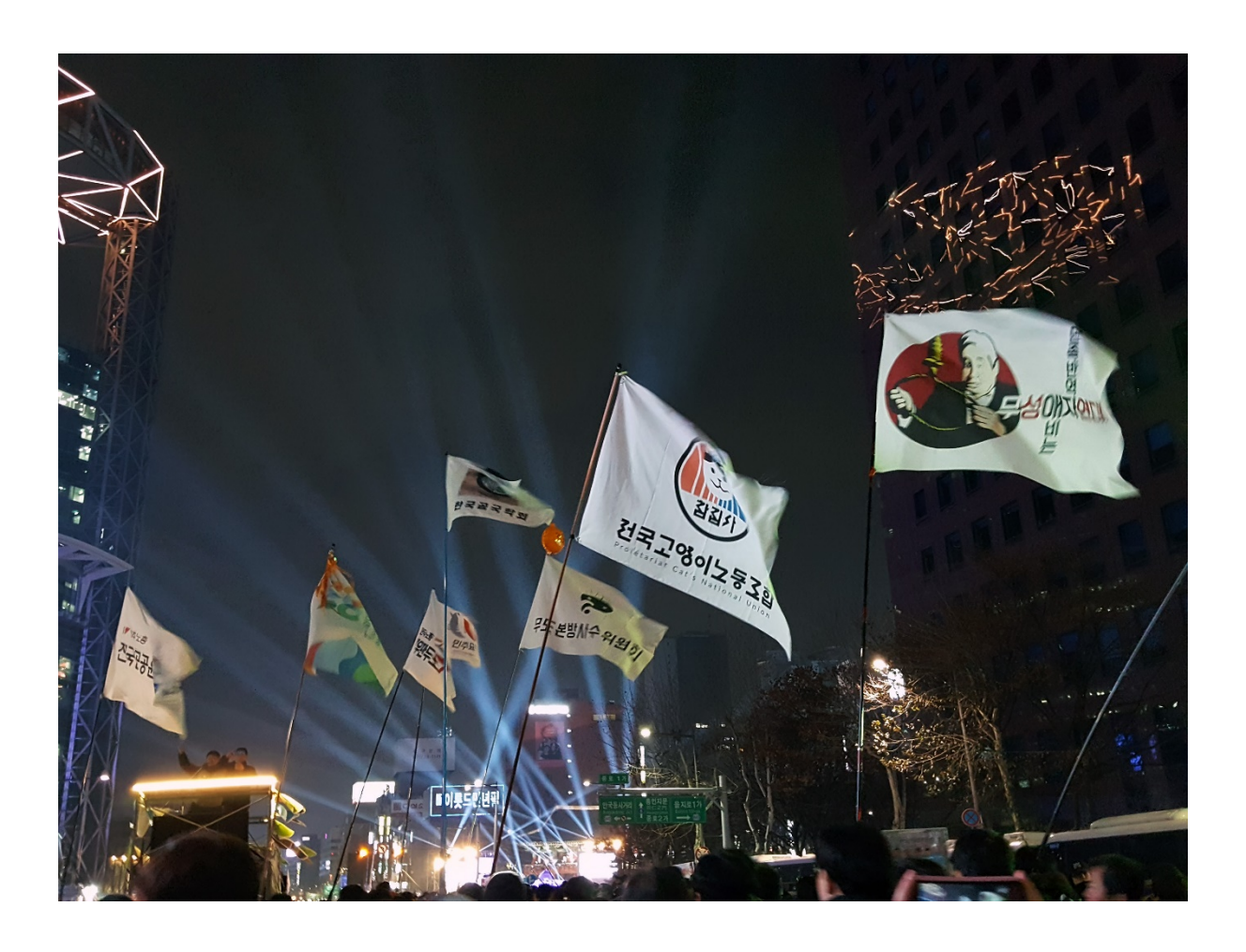
Picture 1 "Gibberish Joke Flag Grand Party"